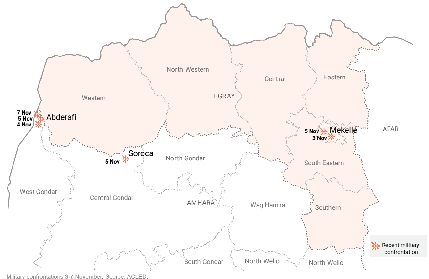
The boundaries and names shown and the designations used on this map do not imply official endorsement or acceptance by the United Nations.

for onward relocation to a reception center in Shagrab camp in Kassala State; 1,700 people have so far been screened and registered. No armed individual will be allowed to cross into Sudan, according to authorities. UNHCR is mobilizing resources to address the life-saving needs of the new arrivals, and identification of a new refugee site is amongst the priorities. UNHCR has a working scenario of up to 20,000 asylum seekers expected in one month, and up to 100,000 asylum seekers expected in one year.